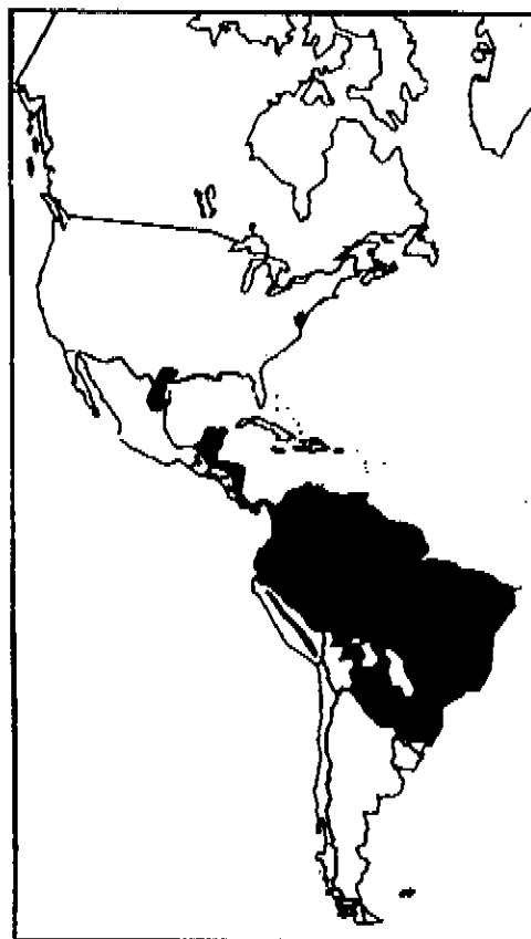
FIG. 3. DISTRIBUTION OF CUTANEOUS AND MUCOCUTANEOUS LEISHMANIASIS IN THE NEW WORLD