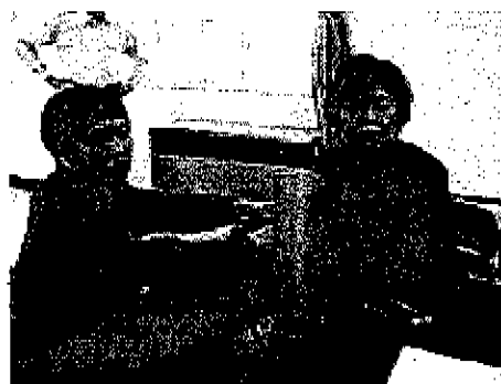
The members in a Japanese health co-op meet for mutual check- up

It could be the clients who own their hospitals. Like the health co-operative movement in Japan, that, like in many other cases started the fact that the public sector could not satisfy the needs of the Japanese after the war. In Japan those health co-ops are still a growing part of the health sector.