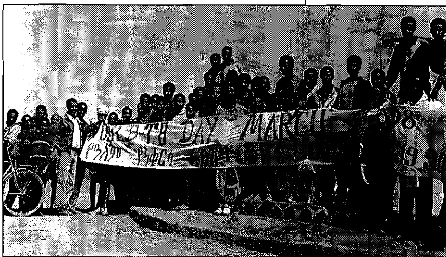
A March in Enjibara, Ethiopia

The District Health Department in Aw Zone organized a TB meeting for local officials to promote the implementation of DOTS.