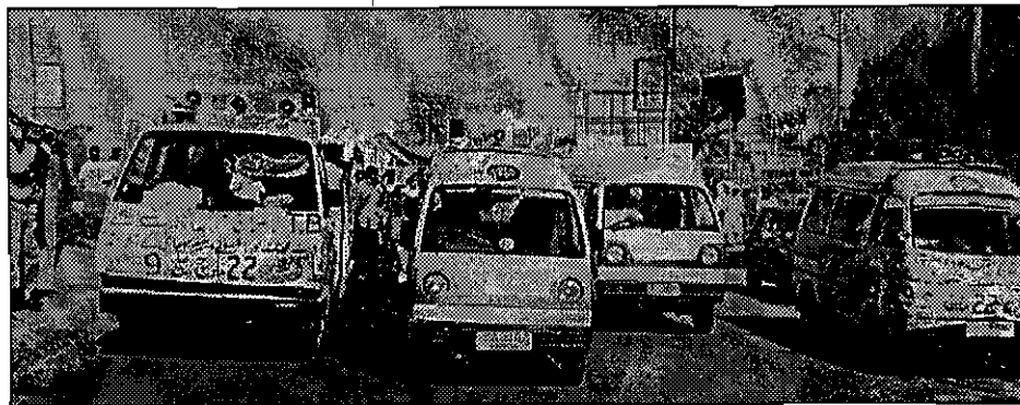
TB Parade, Karachi, Pakistan

The Aga Khan University in Karachi organized activities designed to heighten public and government awareness of the widespread threat of TB in Pakistan. A public awareness seminar and lecture held at the Aga Khan University auditorium were very well attended by the general public. Print and