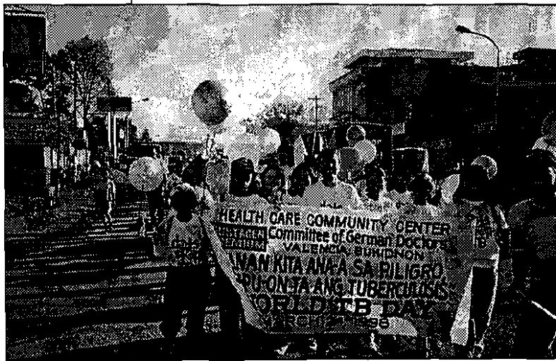
TB March, Bukidnon, Philippines

The WHO regional office in Manila issued a statement highlighting the scale of the epidemic in Asia and progress in TB control stalled in key high-burden countries in the region.