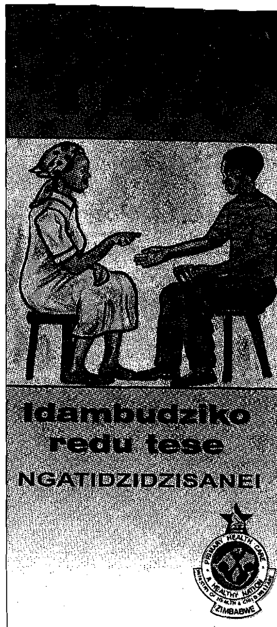
TB brochure, Zimbabwe

The Ministry of Health and Child Welfare produced an information kit with brochures on tuberculosis for World TB Day.