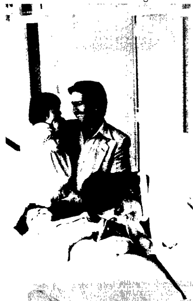
Trained childbirth assistance drastically reduces the risk involved in becoming a mother.

“Currently, 26.7% of the world's children under five years of age are malnourished.”