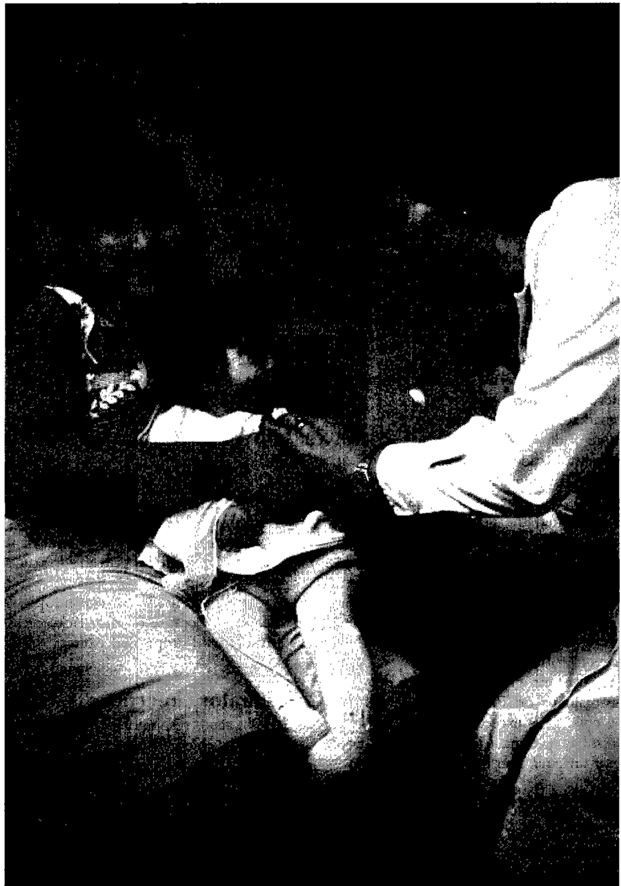
Four out of five children are fully immunized against six major killer diseases.

On 31 January 2000, the new Global Alliance for Vaccines and Immunization (GAVI) was formally announced at the World Economic Forum in Davos, Switzerland. It represents a commitment by the World Health Organization, UNICEF, the World Bank, industry, philanthropic foundations and public sector agencies to work in partnership towards the protection of all children against major vaccine-preventable diseases.