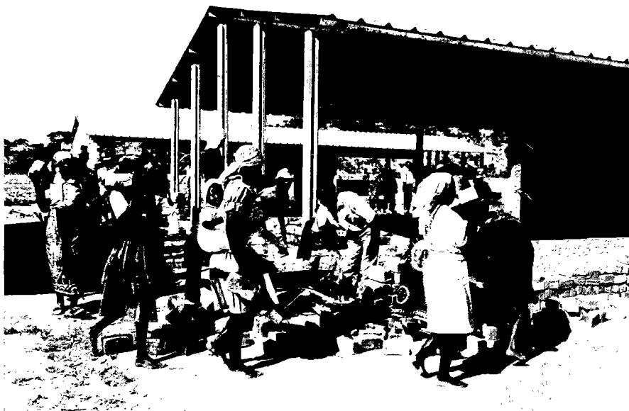
Health improvements are disproportionately beneficial to the poor because they are wholly dependent on their labour power.

If health is an asset and ill-health a liability for poor people, protecting and promoting health are central to the entire process of poverty eradication and human development. As such they should be goals of development