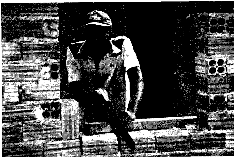
Without health, people cannot contribute to development. Policies such as free health care contribute to the health status of the poor by reducing a major cause of poverty.