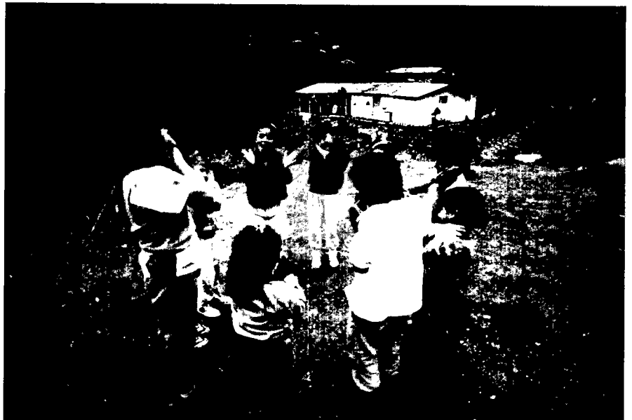
Health is an asset for playing, learning and working.

As its particular contribution to this new strategy, the World Health Organization proposes the following three areas of action as integral components of the follow-up to Copenhagen Plus Five.