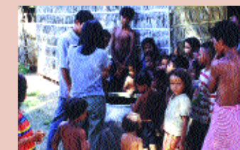
Educating children about safe water storage

To reduce the burden caused by dengue and DHF, WHO is promoting implementation of the Global Strategy.