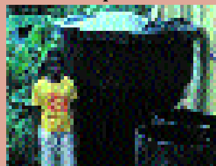
Water storage containers should be made mosquito-proof