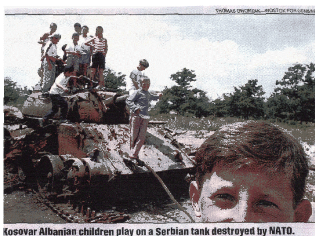
Figure 6.3 Kosovar Albanian children playing on military equipment following the Kosovo conflict. Such activities may lead to significantly increased probabilities of exposure to DU. (photo used with the permission of National Gulf War Resource Center, see www.ngwrc.org ).

For example if DU from the impact of a 4.85 kg penetrator (50% volatilized) were evenly dispersed over a radius of 10 m to a depth of 10 cm it would produce a uranium concentration in soils of approximately 96 mg/kg. This value is above that observed in most natural soils and similar to that observed in dusts in the Amman area of Jordan in which phosphorite has been mined (Smith et al., 1995). However, if a similar release of uranium was restricted to the upper 1 cm of soil, as might be expected from the deposition of atmospheric particulates onto uniform soils of a high clay content, then the resultant concentration, assuming even airborne dispersal, would be in excess of 960 mg/kg. While the presence of elevated concentrations in the near surface region of soil profiles is likely to reduce transfer to plants, it is more likely to facilitate inadvertent exposure to uranium in dusts and other re-suspended forms.