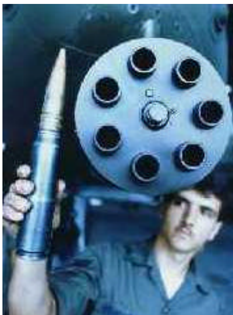
Figure 6.2 DU munition used by an A-10 Warthog aircraft and the Gatling gun from which it is fired.

It was considered during these studies that the pyrophoric nature of uranium was of special relevance to the potential health effects and environmental redistribution of uranium resulting from DU use in munitions and armour. Studies of the use of DU munitions have indicated that up to 70% of the DU in a given projectile may be converted to dust and aerosols on impact (AEPI, 1995). Other studies (CHPPM, 2000) indicate a lower estimate of 10% to 37%, depending upon the exact nature of the impact (i.e. with armour or other material such as concrete surrounding the target). This large discrepancy in reported conversion efficiencies may be due to variations in the hardness of the target, the velocity of impact and the angle of impact. The lower conversion figure agrees with information from the Pacific Northwest National Laboratory (formerly Batelle Pacific Northwest Laboratory) and indicates that when DU penetrators were heated under controlled environments (at about 1200°C) about 30% of the uranium was oxidized. In this case, over 99% of the formed uranium-oxide particles were greater than 20 µm AMAD (Mishima et al., 1985) and could therefore be considered as being non-respirable.