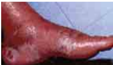
Signs of a recent acute attack: peeling of the skin