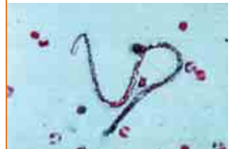
Microfilaria in the blood

Lymphatic filariasis is caused by thread-like parasitic worms, called filariae.