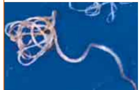
Macrofilaria, the adult stage