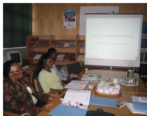
Some members of the Swaziland CCS Development Team during a working session held at Ezulwini