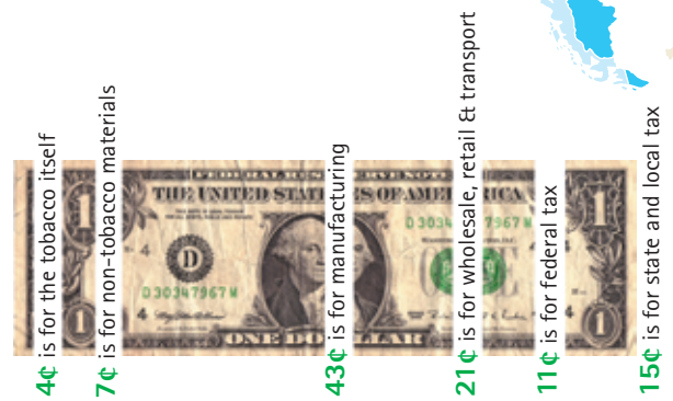
Where the tobacco dollar goes For every dollar spent on tobacco in the USA...

Because of the use of additives and other technologies, such as "fluffing" and the use of reconstituted tobacco, tobacco companies use less and less tobacco per cigarette.