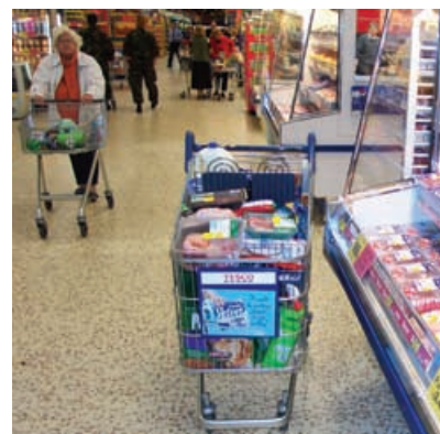
People change what they eat