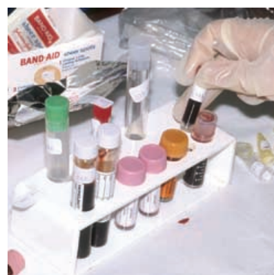
Blood contains more than cholesterol