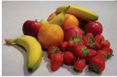
How do fruit and vegetables help the heart?