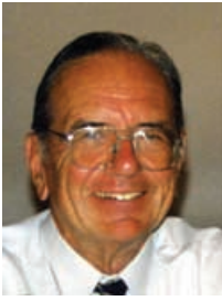
Fred Gey promoted the vitamin-antioxidant hypothesis