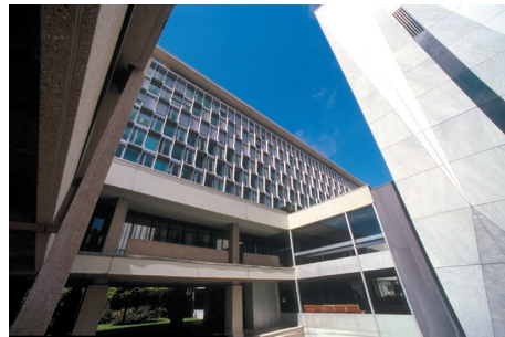
World Health Organization headquarters, Geneva

The capacity of virtually all cardiovascular disease control organizations is inadequate to meet the challenge of the CVD epidemic.