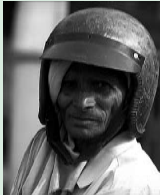
A helmet chin strap that is loosely fastened is recorded as “incorrect use” when observations of helmet use are being assessed.